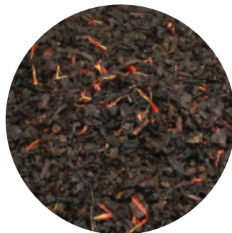
Fig and lavender taste, black tea, fig bits, lavender flavorings.