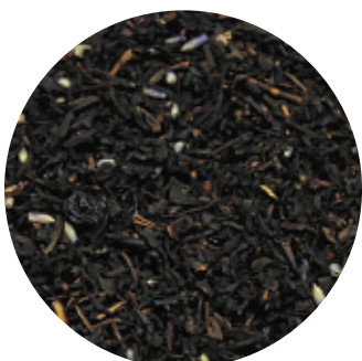
FIG AND LAVENDER

Vanilla and cinnamon taste with sparkling sugar, gold sprinkles and botanicals.