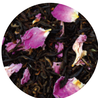
Fig and lavender taste, black tea, fig bits, lavender flavorings.